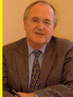
Sir Alan Beith MP Berwick-upon-Tweed

Visit http://carersweek.org/parliamentary/mps-who-support-carers to read the statements of support from MPs who have responded to our call for them to express their support for carers and Carers Week. Pictured are the first four MPs to support Carers Week 2011.