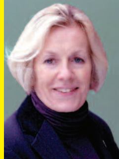
Tessa Munt MP Wells

Write to your MP at the House of Commons, Westminster, London SW1A 0AA. Or email them via http://findyourmp.parliament.uk