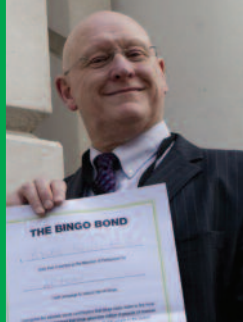
Hywel Williams MP Arfon