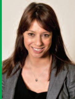
Gloria Del Piero MP Ashfield